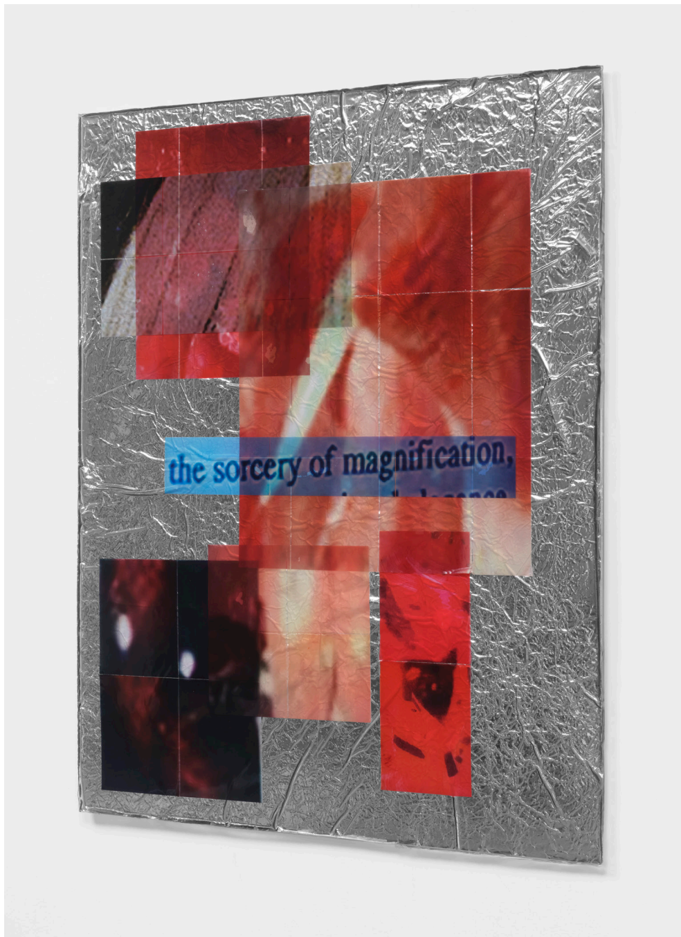
Moments (alternative view)