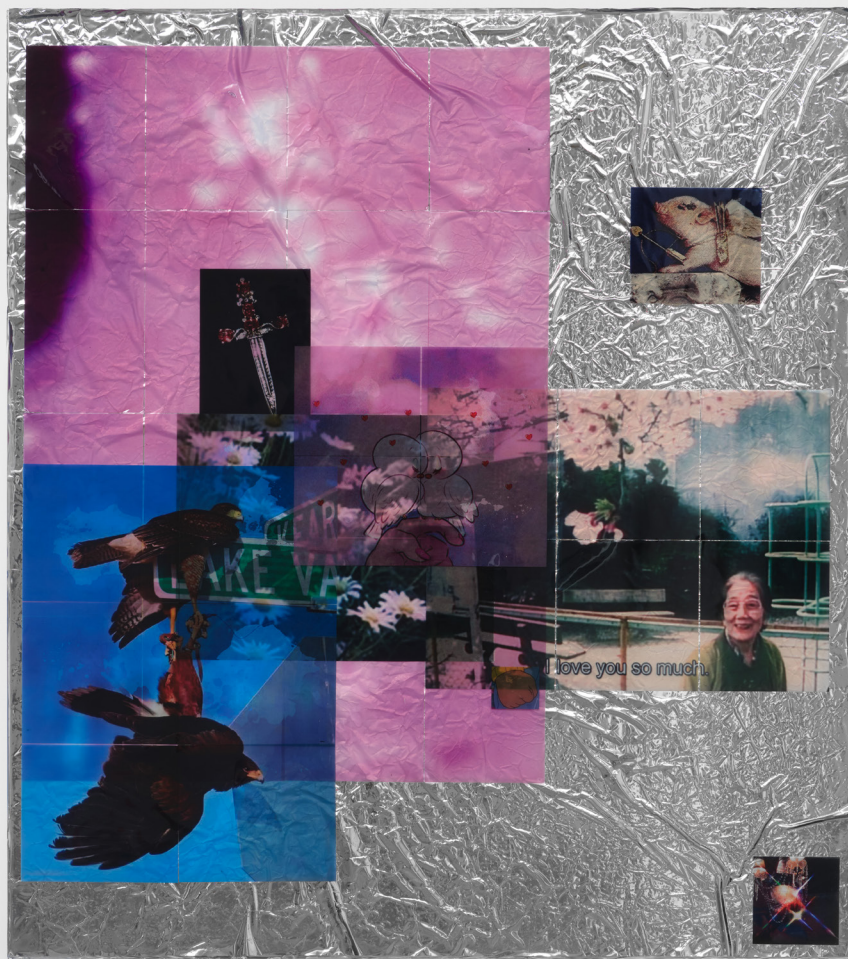
I love you so much , 2025 Mylar, digital prints, resin 120 × 135 cm 47 1/4 × 53 1/8 inches (ES66)