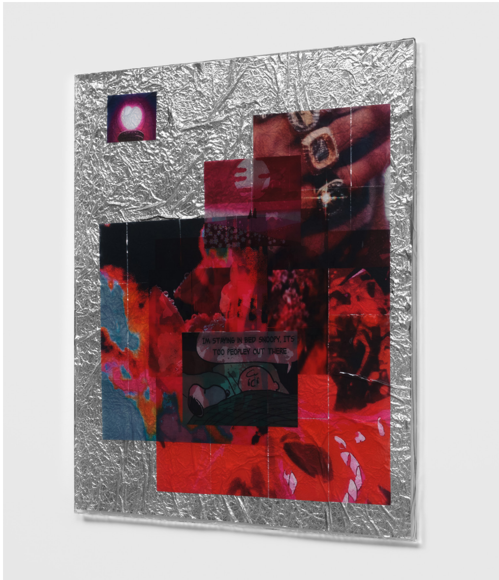
Too many people out there (alternative view)