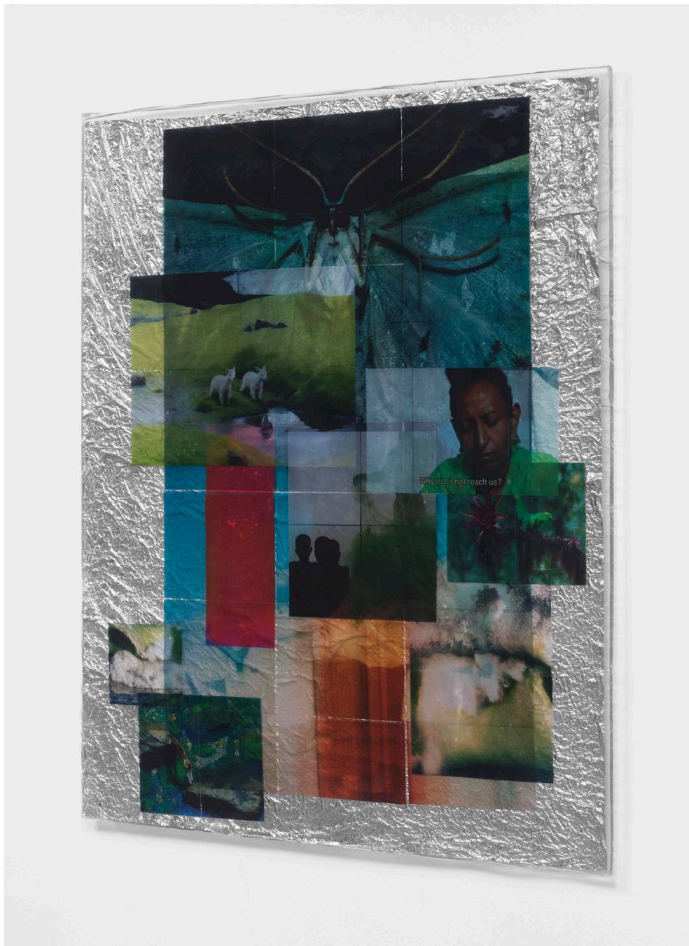
Why did it not reach us (alternative view)